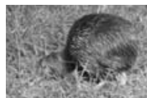
Female kiwi spotted feeding in long grass at Port Charles

It was around 5pm and still light as MEG Chair Lettecia Williams was finishing one of her traplines. She had just closed the paddock gate when she noticed something moving in the tall kikuyu grass. She looked a bit closer and saw a huge female kiwi probing and feeding!! Oblivious to her audience the kiwi, which looked plump and healthy, continued to feed for about 20 minutes. More curious was the sight of the normally nocturnal bird, out feeding in the day.