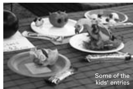
Some of the kids' entries

As well as 1st, 2nd, 3rd in each class next year we are going to have "Highly Commended" as there were so many excellent entries that needed a mention.