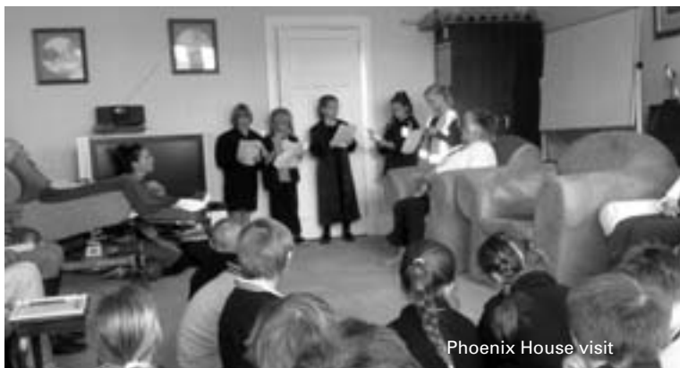
Phoenix House visit