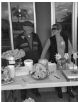
The stall outside the BNZ

I hear Four Square and The Bizarre also did a wonderful job of promoting and fundraising on the day. In fact it appears that a large number of businesses and local residents got in behind the day to make it the most successful Coromandel Daffodil Day yet.