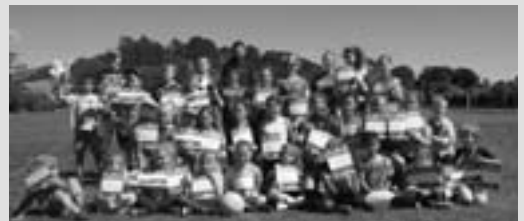
Our school football teams – mini kickers, 9th grade and 11th grade at their end of year prizegiving

All of our classes have been working hard to prepare for our science fair at the end of the term. Our focus has been the physical and material world with our teams of learners collaborating on projects. They can't wait to have an audience to question and inquire about their learning.