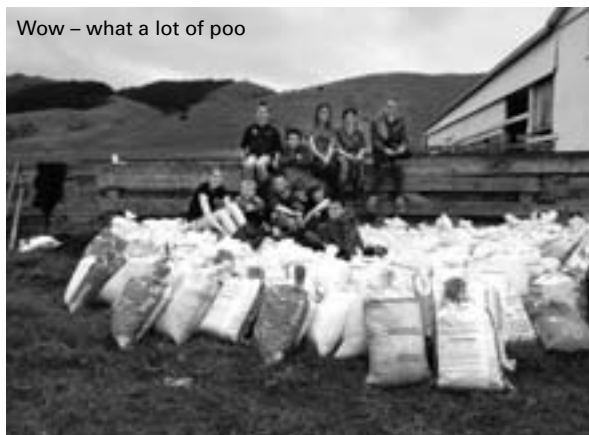
Wow – what a lot of poo

The few spots of rain do not faze either of us I just pull my cap lower to keep rain off my specs.